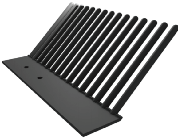
RL Vented Comb Filler

Prevents entry of birds and nesting insects